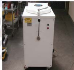
20 Part Dough Divider