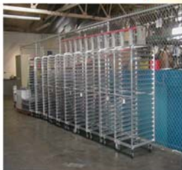
Industrial Pan Racks