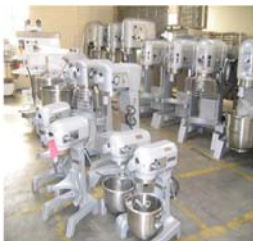
Hobart Mixer Stock