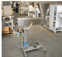
Single Piston Depositor

*Pictures are representative of our ever changing stock