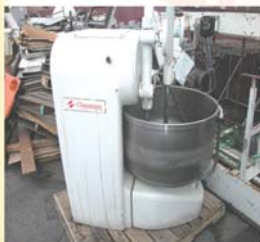
Champion Pie Mixer