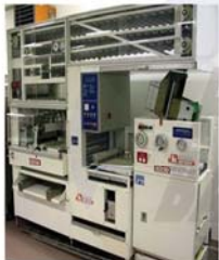
Konig Roll System