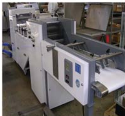
Benier Bread Moulder