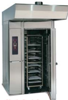
Single Rack Oven