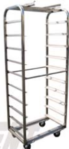
Baxter Single Oven Rack