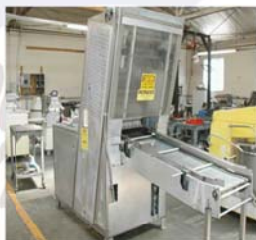
UBE 90-75 Slicer