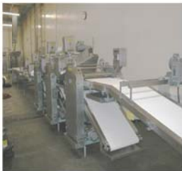
Moline Sheeting Line