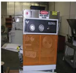
WP 5 Rows