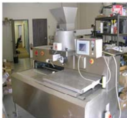
Traymatic Cookie Former

FOOD MAKERS BAKERY EQUIPMENT FMEbakery.com