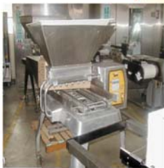
Ragen Cookie Depositor