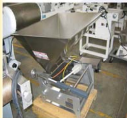
Hinds Bock Muffin