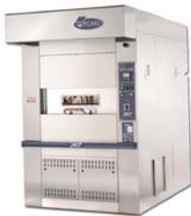
MT-4-8 8 Pan Capacity