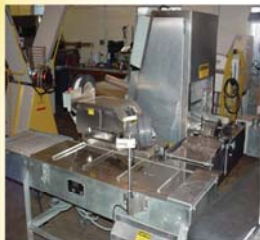
UBE 10 Slicer