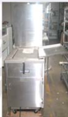
Lucks Donut Fryer