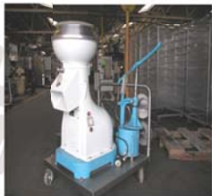
Halldal Food Processor