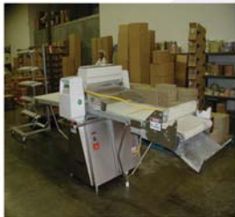
Rondo Compass Sheeter