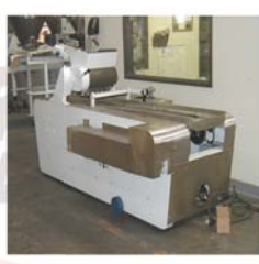
Werner Wire Cut