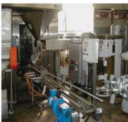
Swirl Cake Line