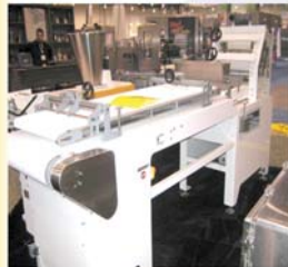
Lane S-4 Moulder