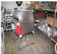
Hayon Pan Greaser