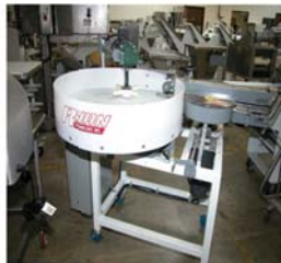
Ryan Bun & Bagel Slicer