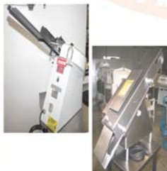
Oliver Bun Slicers