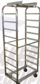
Lucks Single Oven Rack