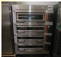
Dahlen Deck Oven