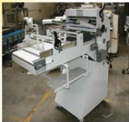
Acme 88 Sheeter