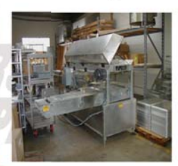
UBE 77 Bagger