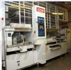
Konig Roll System