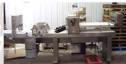
Rondo Pastry Line