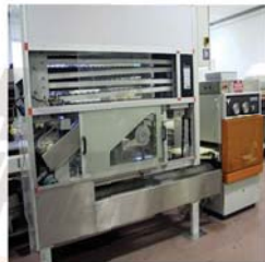
WP Roll System