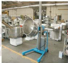
Savage Bowl Lift