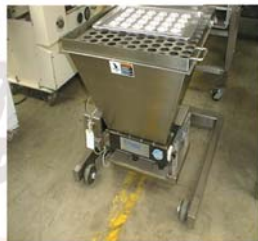
Fedco Muffin Depositor