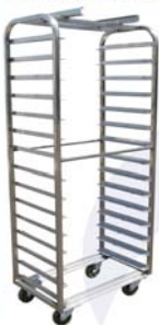
LBC Single Oven Rack

THIS IS A PRESENTATION OF SOME PRODUCTS WE MANUFACTURE