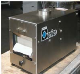
Finger Roll Moulder