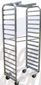
Baxter Single Oven Rack