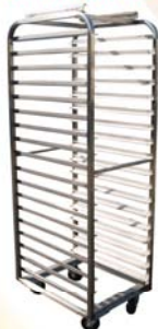
Baxter Single Oven Rack