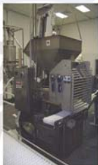
Baker Perkins Dough Divider