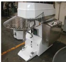
Removable Bowl Mixers