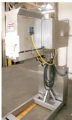
Rykaart Streussel Depositor