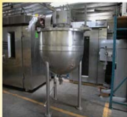
Lee 200 Gallon Kettle