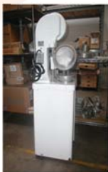
Kaiser Pie Press

*Pictures are representative of our ever changing stock