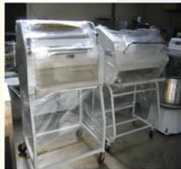
French Bread Moulders