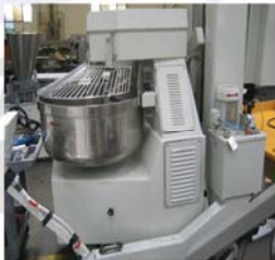
Tipping Spiral Mixer