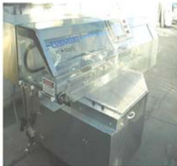
Formost G-T 4 Wrapper