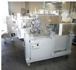
Rheon Croissant Machine