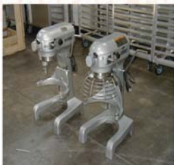
Hobart Bench Mixers