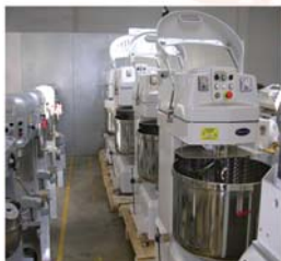
Dough Mixers in Stock