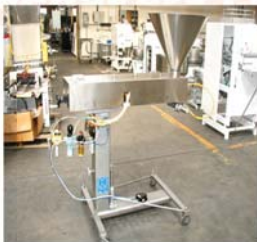
Hinds Bock Spot Depositor