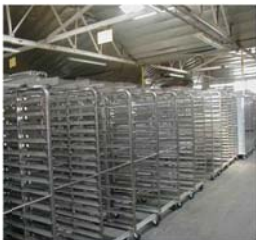
Industrial Oven Racks