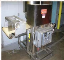
Fedco Cake Top-Icer