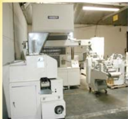
Oshikiri Roll Line