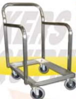
Model: SSPD-1826 Shown Here