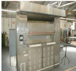
Revolving Tray Ovens