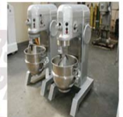
60 Quart Mixers