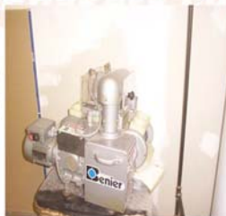
Kaiser Roll Machine