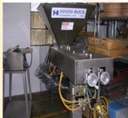
2 Piston Depositor