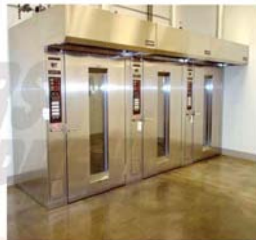
Lucks Rack Ovens