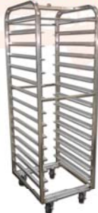
Revent Single Oven Rack