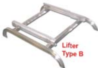
Lifter Type B