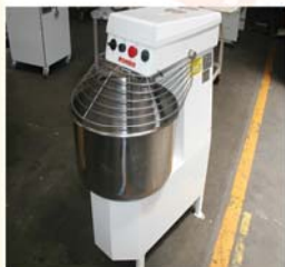
Rondo Spiral Mixers