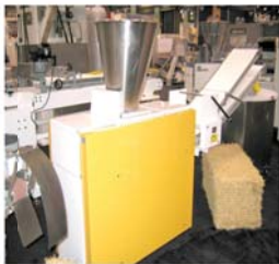
Kemper Dough Divider