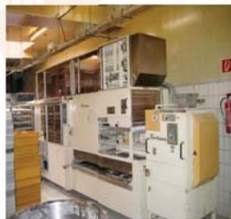
Fortuna Roll System

*Pictures are representative of our ever changing stock