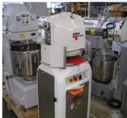
Erika Automat Divider