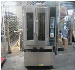
Baxter Mini Rack Oven