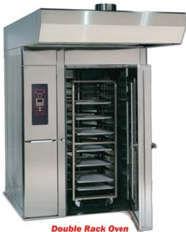
Double Rack Oven