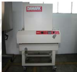
Heat Shrink Tunnel