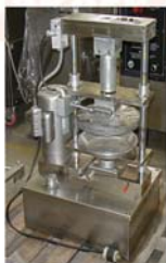
Comtec Pie Press