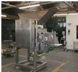
Alliance Dough Feeder

FOOD MAKERS BAKERY EQUIPMENT FMEbakery.com