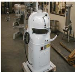
Fortuna 36 Part