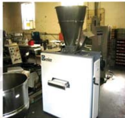
Benier Dough Divider