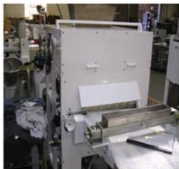
Fortuna Roll Machine