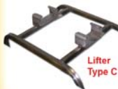
Lifter Type C