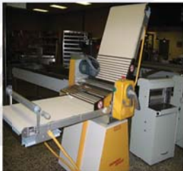
Rondo Ecomat Sheeter