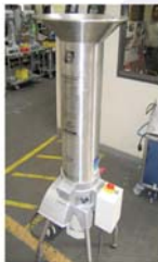
Bread Crumb Grinder