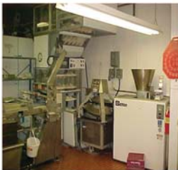
Benier Bread Systems