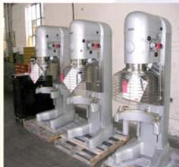
Hobart 140 Mixers