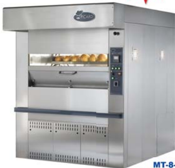
MT-8-24 24 Pan Capacity

One major advantage of Picard Ovens, its self-generating steam system. With this oven's technology you will obtain flavorful and quality products. It is the most versatile oven compared to all other brands on the market!