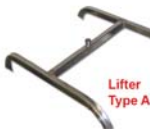
Lifter Type A