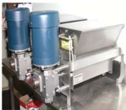
Moline Flour Dusters