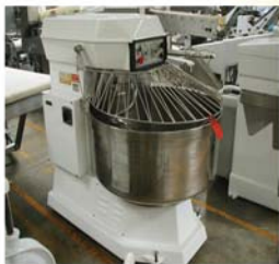
Fixed Bowl Mixers