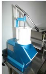
Halldal Food Processor