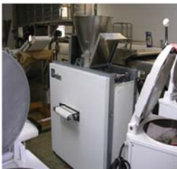
Benier 2 Piston Divider