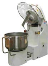
New Sottoriva Dough Mixers