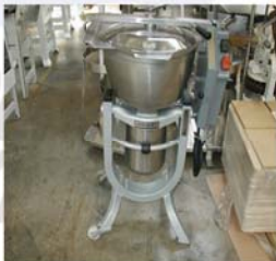
Vertical Cutter Mixers