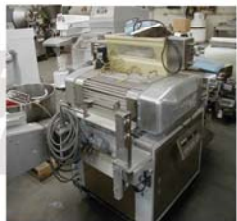
Rheon Action Roller