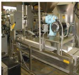
Colborne Top Icer

*Pictures are representative of our ever changing stock