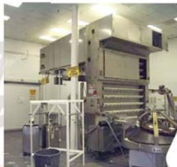
APV Bread System