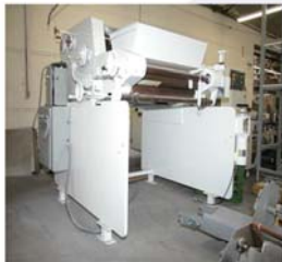
APV Over-the-Band Wire Cut