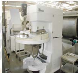
Benier Wendel Mixer