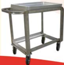
Model: SPC-1826 Shown Here