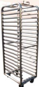
Revent Single Oven Rack