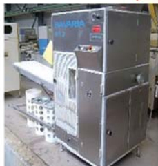
KB High Speed