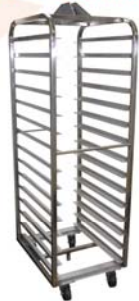
Dahlen Single Oven Rack