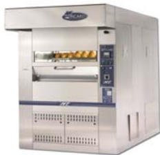
MT-8-16 16 Pan Capacity