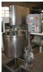
TSA Cake Mixer