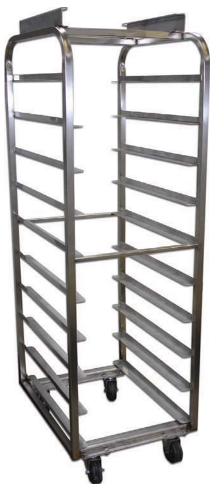
Stainless Steel Single Oven Racks