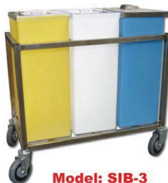
Model: SIB-3 Shown Here