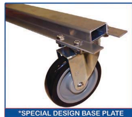
*SPECIAL DESIGN BASE PLATE