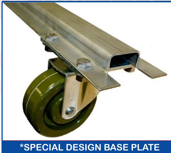
*SPECIAL DESIGN BASE PLATE