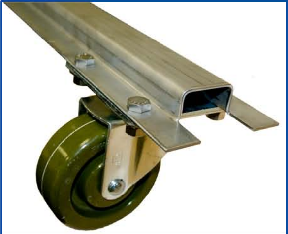
*SPECIAL DESIGN BASE PLATE