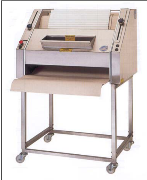
Model LBM-20 shown