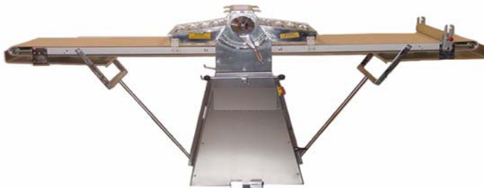
Model RDS 10/24 shown