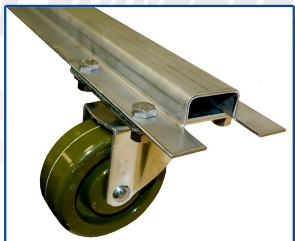
*SPECIAL DESIGN BASE PLATE