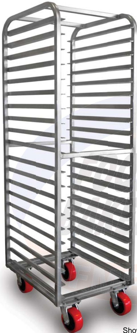
Shown Here SPE-203