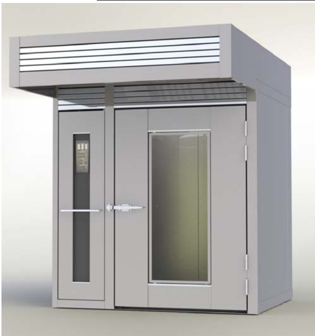
Model LRO2G-E Shown (Rack not included)